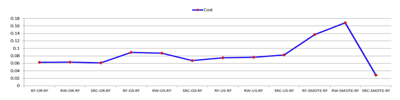
Figure 1. The cost of the combined models

The results of 12 models on 9 performance measures are in Table 6. Figures 1 to 4 present the Cost, Precision, Recall, F-score, and Accuracy of the combined models.