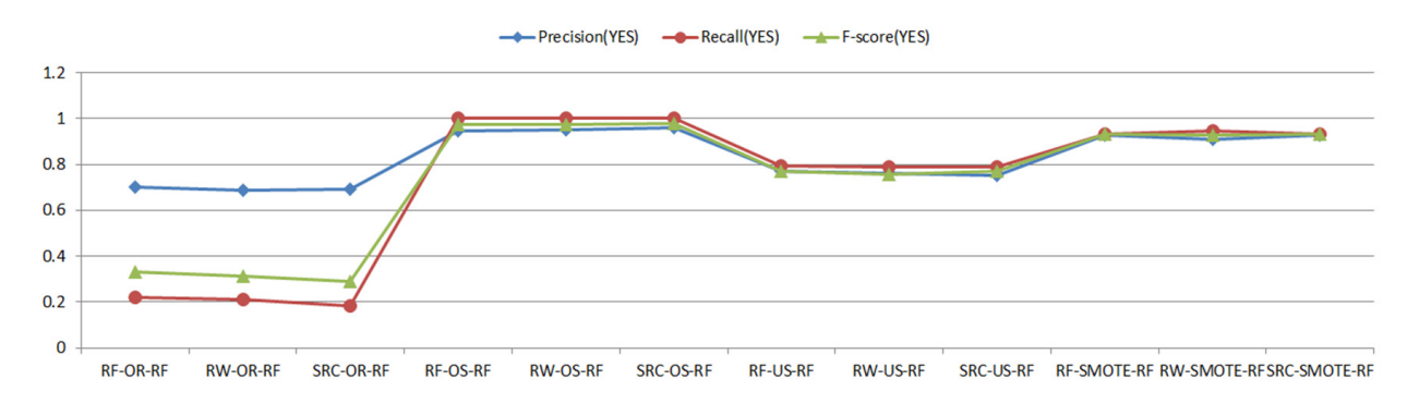
Figure 2. The precision (YES), recall (YES) and F-score (YES) of the combined models