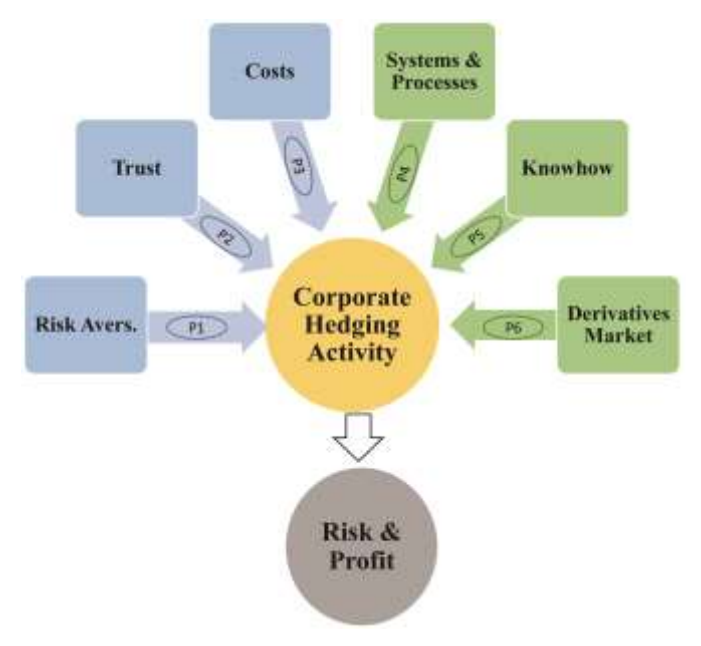
Figure 1. Preliminary impact analysis model

Based on the above-mentioned suggestions, a preliminary model is created that should help analysing the impact of the regulatory changes on NFCs corporate hedging activities with the blue boxes representing the willingness to hedge and the green boxes the ability to hedge in an optimal way.