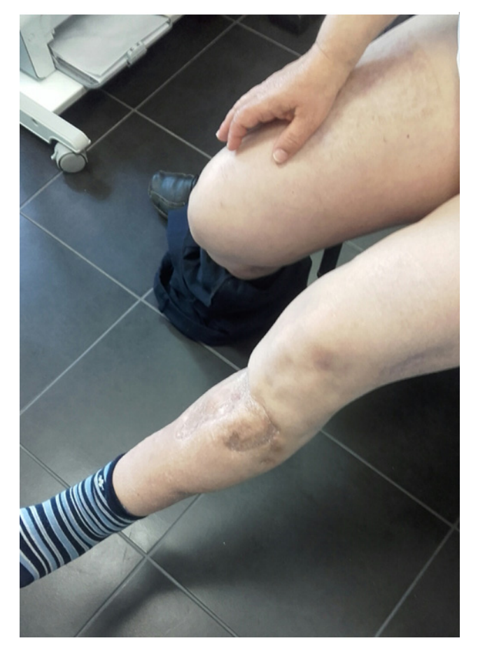
Figure 2. The lower extremities injuries by bites of Belgian Shepherds

The nurse was examined at the Department of Occupational medicine in order to assess her remaining work capacity in December 2015. Although the patient was severely injured and suffered polytrauma, developed PTSD with serious