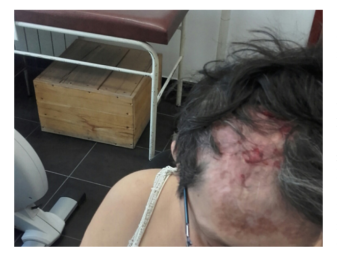
Figure 1. Scars of the scalp caused by bites of Belgian Shepherds