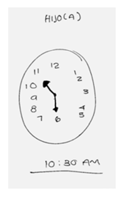
Figure 3. Example of participant's idea of using a clock to replace the sleep log in the sleep diary