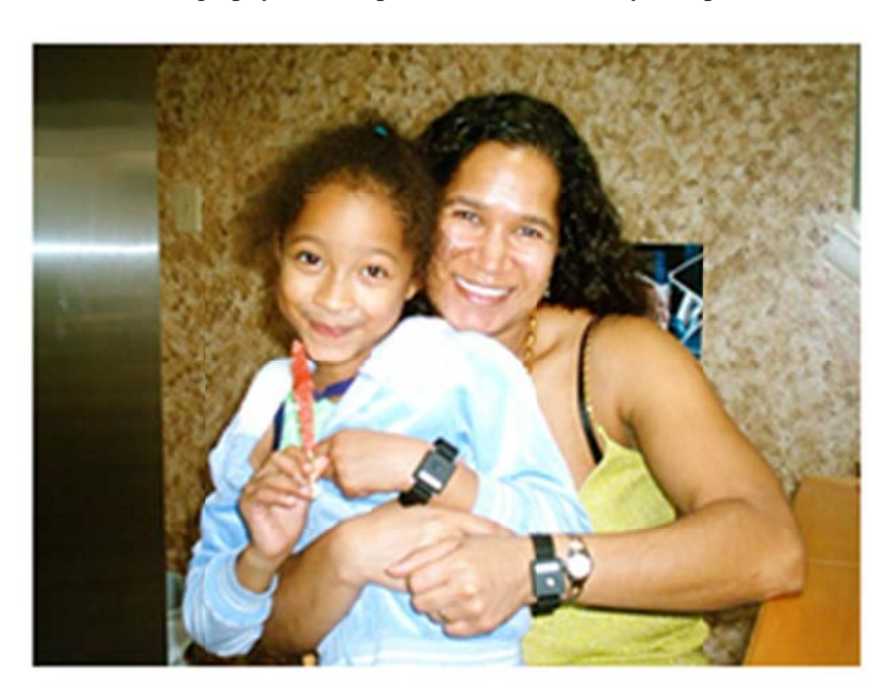
Figure 1. Mother and child dyad wearing wrist actigraph (Actigraphs courtesy of Actiwatch, Mini Mitter, Sun River, OR)

Latino children experience high rates of overweight and obesity <sup>[2]</sup>. In the Latino culture mothers shape their family's lifestyle habits such as diet and physical activity <sup>[23, 24]</sup>, therefore future interventions to prevent obesity in children should incorporate healthy sleep education for Latino mothers. However, few studies have examined how mothers shape children's sleep patterns and behaviors in the home environment. To understand how to incorporate healthy sleep education as a way to address obesity in Latino children, it is important to study maternal and child sleep behaviors in a home and community setting. One challenge to studying sleep in Latinos is that it is not known if current methods of assessing sleep, such as with wrist actigraphy and sleep diaries, are culturally acceptable to this vulnerable population.