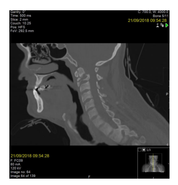
Figure 5. Sagittal CT taken 6 months later

The most probable diagnosis was Brown tumour of the C2 and this was related to persistent secondary hyperparathy-roidism and associated ESRD.