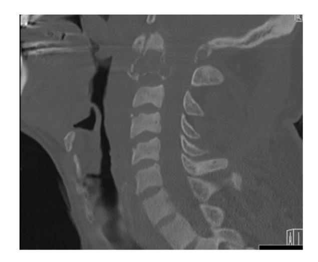
Figure 1. Lesion seen on sagittal CT cervical spine

On physical examination there was reduced tone in the upper limbs, with weakness in both upper limb (C5-T1) and lower limb (L2-S1) myotomes. The MRC power grading was 2 in all the myotomes. Sensation was altered to pin prick in the upper and lower limb dermatomes The reflexes were reduced. The patient also had bladder and bowel dysfunction. The patient was alert and orientated in time and place with no features of a cerebro-vascular insult. Blood results confirmed chronic renal failure with raised parathyroid hormone (PTH). This was suggestive of secondary hyperparathyroidism due to chronic kidney disease. He was treated according to the ATLS (Advanced Trauma Life Support) guidelines in the emergency department. Computed tomography (CT) of the spine showed destruction of the left pedicle and body of the C2 vertebra and a reduction in height of the vertebra. There was disruption of the bony alignment at this level with upper cervical cord compression and there were further lytic lesions seen in the spinous process of C1, right T1 and T3 pedicles and the left 1st rib. The differential at this point of bony metastases, in view of a pathological C2 fracture and other lytic lesions, was given alongside Brown tumour in the context of chronic kidney disease. CT of his chest, abdomen and pelvis was performed to rule out malignancy (see Figures 1-3).