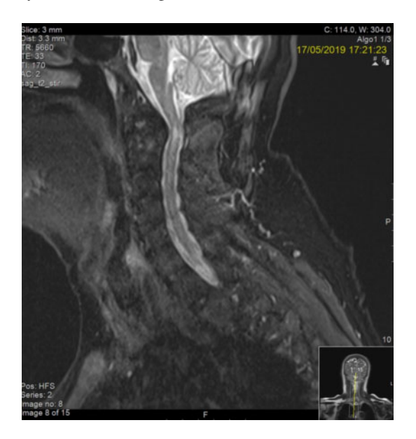
Figure 4. MRI sagittal with ischaemic changes in the cervical spinal cord

appearance of C2 and narrowing of the cervical spine at this level. There was a focal area of central intramedullary hyper signal intensity. Multilevel flavum, ligament and facet hypertrophy from C3 to C7 with significant canal stenosis and chronic degenerative changes were also noted. There was no significant foraminal narrowing causing nerve root compression. A CT guided bone biopsy confirmed a significant amount of fibrous tissue, but no giant cells. Endocrinology opinion was sought to address the deranged thyroid and kidney function (see Figures 4-5).