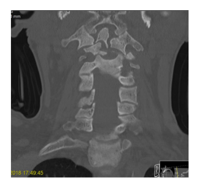
Figure 2. Lesion seen on coronal CT cervical spine

normal appearances of the thyroid with no evidence of parathyroid adenoma. Further nuclear medicine Parathyroid SPECT scan showed no evidence of malignancy. Other investigations included tumour markers, protein electrophoresis, were performed in order to confirm the absence of metastatic disease and bone marrow infiltration. Whilst there is a well understood relationship between renal impairment and primary and secondary hyperparathyroidism, it is necessary to rule out adenoma, hyperplasia and carcinoma in patients who develop primary hyperparathyroidism.