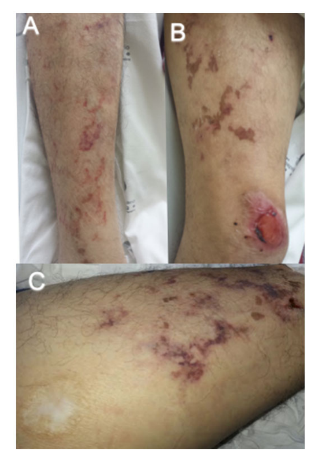
Figure 4. A, B & C. Lower extremities with ecchymoses following a net-like pattern B. Bleeding skin sore is also visible on right knee. C. A pale atrophic scar is also present on right thigh

Written informed consent and authorization to publish and reproduce confidential information was previously obtained from each patient.