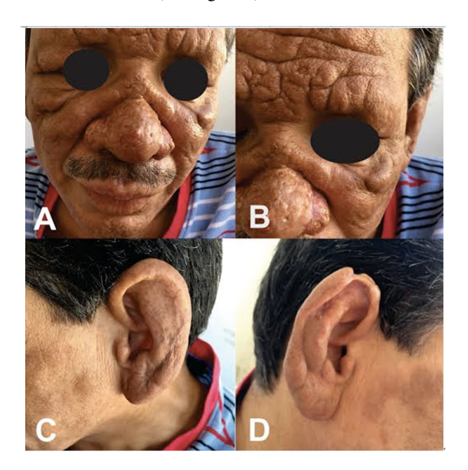
Figure 2. A & B. Leonine facies: loss of eye brows (madarosis), destruction of the nasal septum and nodular dermak lesions that alter facial configuration. C & D. Thickened and deformed pinna

A 49-year-old male presented with a history of 8 years of ulcerative lesions in lower limbs associated with progressive pain, arthralgias, purulent discharge and abnormal gait. On examination ulcerative lesions were found in mid-distal third of both legs (see Figure 1), he was also reported to have generalized hyporeflexia, thenar and hypothenar neural atrophy, painless nodules on forehead, cheekbones and brows, as well as a deformed and hypertrophic auricle with partial loss of skin continuity, madarosis, nasal bridge lowering and thickened alae nasi (see Figure 2).