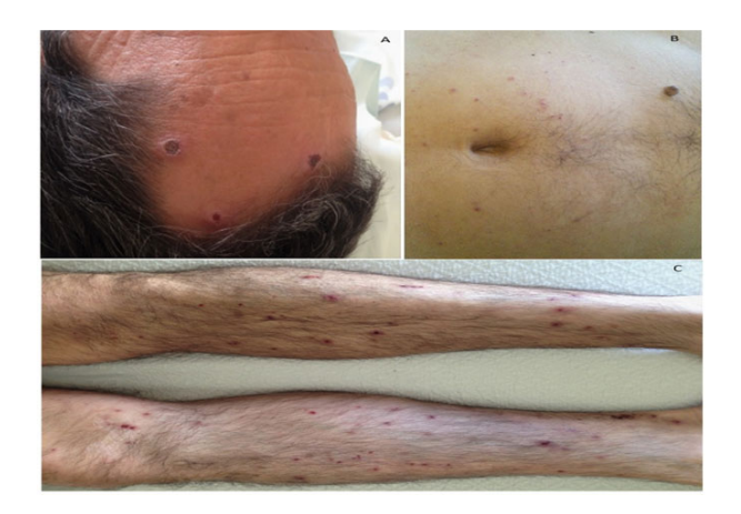
Figure 1. Cutaneous lesions of Case: A. Head: crusted and ulcerated lesions of forehead. B. Abdomen: ulcerated erythematous nodules of abdomen. C. Legs: erythematous papules and nodules of legs.

normal and without motor or sensory deficits. The patient had multiple round, papular and nodular lesions with larger central ulcerations of the head, abdomen and the legs (see Figure 1).