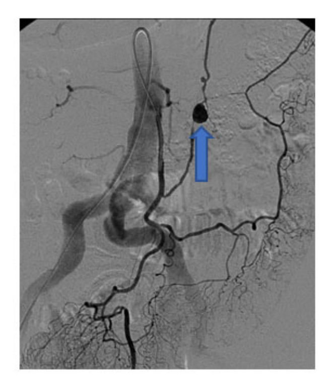
Figure 3. Abdominal angiography after six months of follow-up, showing a new aneurysma