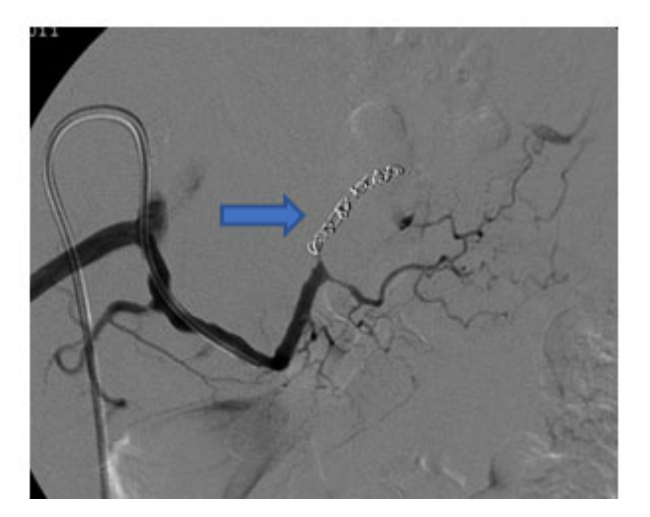
Figure 2. Angiography showing successful coiling

Six months after the patient's initial presentation, a followup CT-scan was performed and showed a novel aneurysma had formed (see Figure 3) in both the superior and inferior arteria mesenterica, with the latter requiring embolization by coiling to prevent further harm. The further clinical course of our patient then was uneventful, except for the development of osteoporosis and pain caused by vertebral compression fractures that were most likely caused by long-term steroid use, despite prophylactic therapy.