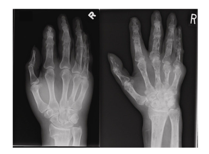
Figure 3. X-ray of the patient's right hand on day 0 (left) and six weeks later (right). The latter film demonstrates extensive and innumerable bilateral symmetric well defined predominantly intra-medullary lytic lesions involving all digits and the distal radius and ulna, resulting in endosteal scalloping, cortical thinning and frank cortical breach in numerous locations.

Despite normalization of the pancreatic markers and treatment with both oral and intra-articular glucocorticoids, his joint pain and swelling worsened. Serial X-rays from the time of admission and 6 weeks later demonstrated the development of multiple osteolytic bone lesions about the involved joints (see Figure 3). Pamidronate was infused monthly as a novel treatment option in an attempt to prevent further bone destruction, but was deemed unhelpful and was discontinued. Symptomatic management for pain control proceeded. The patient succumbed to complications of his immobility within a year of diagnosis.