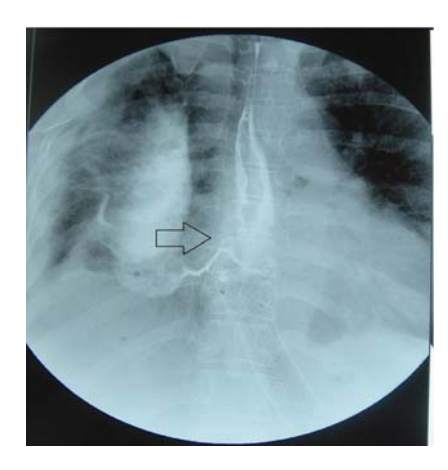
Figure 3. Barium Swallow showing fistulous tract from lower thoracic esophagus with right pleural cavity just above the level of upper margin of esophageal stent