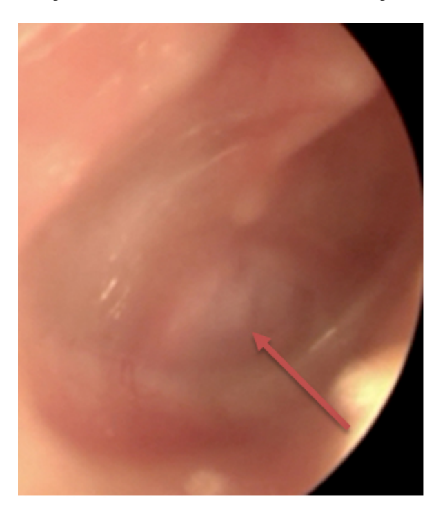
Figure 2. Right tympanic membrane view by endoscopy at 5 months showing retrotympanic pulsatile mass (arrow)

The patient was admitted to the pediatric ward for bleeding