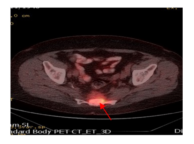
Figure 2. PET Scan showing high FDG uptake in the soft tissue mass in the presacral area corresponding with the tumour identified on the recent CT