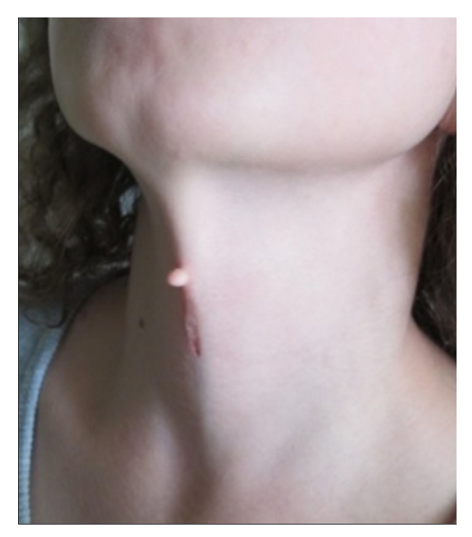
Figure 1. A 14-year-old girl with CMCC before surgery