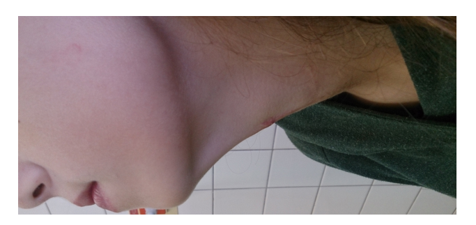
Figure 6. Follow up after two years after surgery. Neck contraction in dorsal flexion of the head and neck.

A follow-up examination carried out two years after the surgery revealed good wound healing of the Z-plasty, no history of discharge. However, neck contraction was presented again in dorsal flexion of the head and neck (see Figure 6). The patient has been therefore scheduled for reoperation.