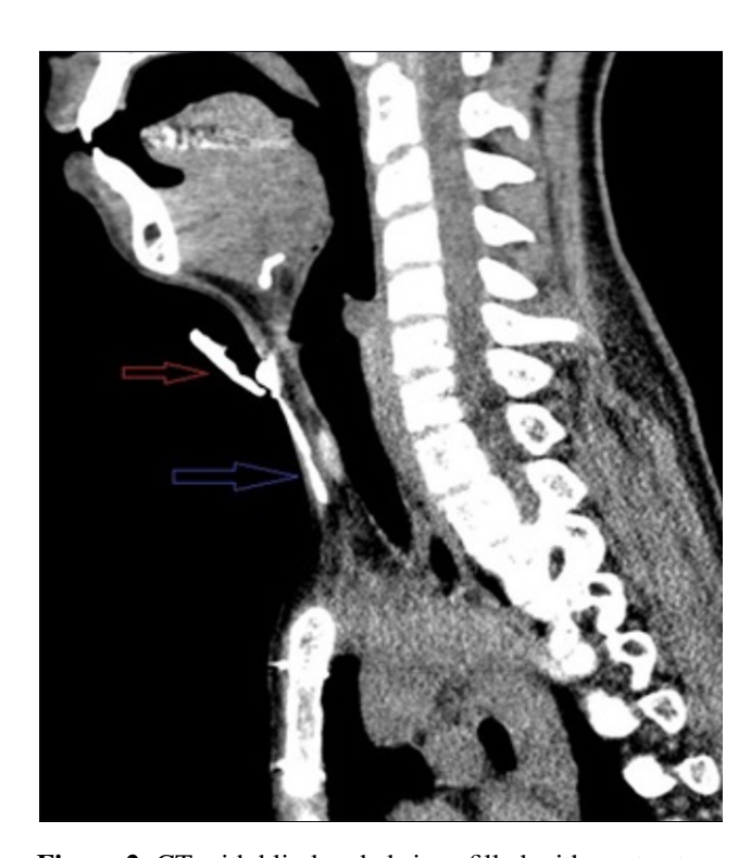
Figure 2. CT with blind ended sinus filled with contrast agents and fibrotic restricting cord Red arrow (intravenous cannula used for contrast instillation); Blue arrow (blind ended fistula filed with contrast agents)

After unclear ultrasonography result CT scan was performed, instilling contrast agents it to the sinus with venous flexible cannula (see Figure 2). CT scan cleared the diagnosis of CMCC by imaging distal blind ended fistula, fibrotic restricting chord and nipple like skin lesion. This figure haven't been published yet.