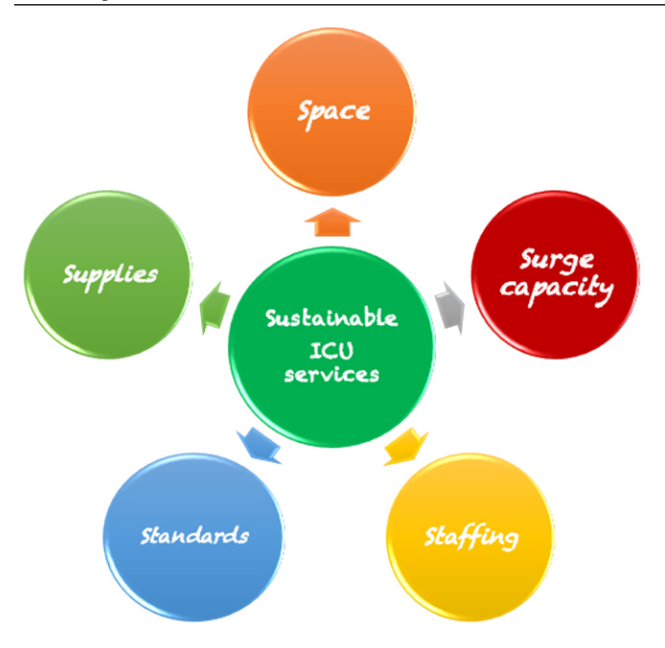
Figure 1. Five areas of focus in preparedness for sustainable critical care during pandemic