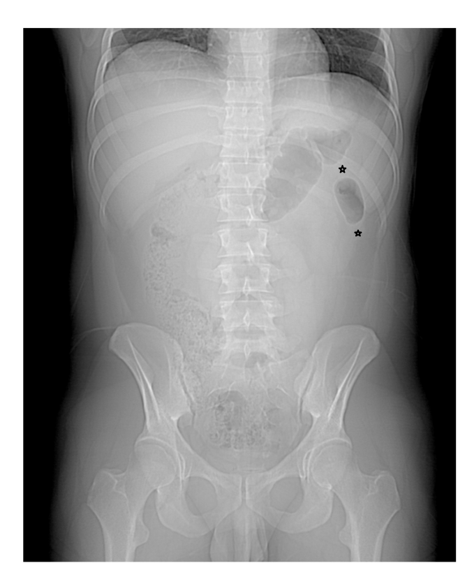
Figure 1. Digital X-Ray of the abdomen demonstrates slightly dilated transverse and proximal descending colon with sudden double terminations of the distal colonic segments (arrows)

colon "double" cutoff sign, which was seen on the abdominal radiograph. On the multiplane reformatted CT scans, the pancreas appeared normal in size and homogeneous in density with widespread peripancreatic fat tissue stranding. Peripancreatic inflammatory stranding was extending to the splenic flexure and proximal descending colon with narrowing/spasm of the related colonic sites. CT scans also showed gas-filled and slightly dilated colon segments with abrupt termination (see Figures 2 and 3). Based on the laboratory test results and imaging findings including colon "double" cutoff sign, a diagnosis of acute pancreatitis was made and proper management initiated.