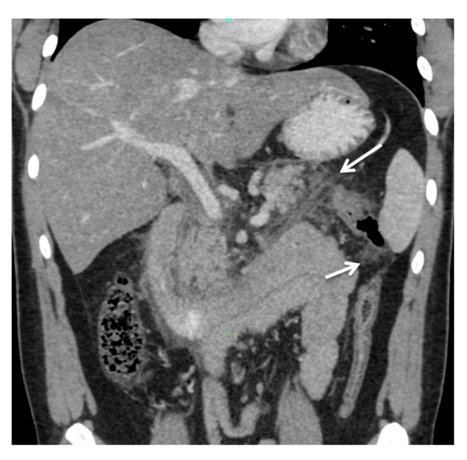
Figure 3. Coronal reformatted contrast enhanced CT image of the abdomen shows the extension of the pancreatic exudates through the phrenicocolic ligament and subperitoneal recess (arrows)

The continuity of the subperitoneal space can explain how the disease spread bidirectionally in the abdomen and pelvis. The subperitoneal space is the area beneath to the serous membrane that outlines the abdominal organs. The anatomic continuity of the subperitoneal space also allows the bidirectional dissemination of the disease between intraperitoneal and extraperitoneal areas and tissues regardless of the mech-