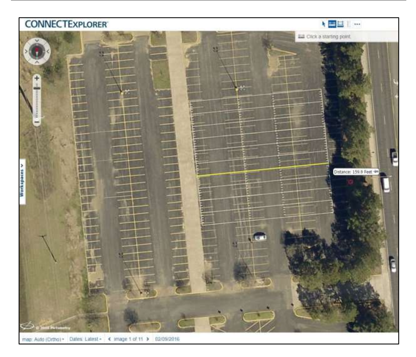
Figure 2. Example of estimating linear feature length within the Pictometry web-based interface.