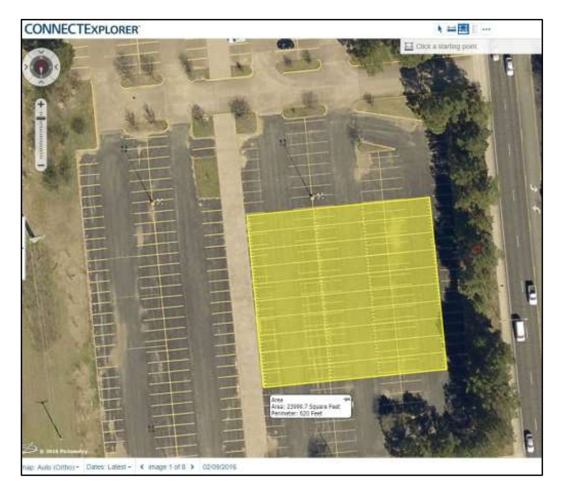
Figure 3. Example of estimating feature area within the Pictometry web-based interface.

Google Earth Pro software is available to all students through the ATCOFA GIS Laboratories. The forestry student was instructed how to measure the linear distances and areas of surface features remotely using Google Earth Pro 7.1.8.3036 (32-bit) developed by Google Inc. (Mountain View, California). Imagery data taken November 2015 was chosen as this was the most recent imagery data displayed for Nacogdoches, Texas. Once the student learned how to measure linear distances and areas within the Google Earth Pro interface, the student was allowed to record measurements himself (Figures 4 & 5).