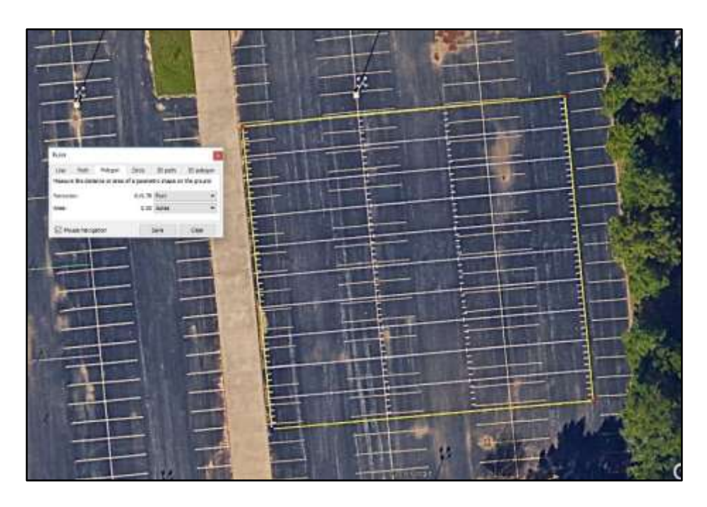
Figure 5. Example of estimating feature area within the Google Earth Pro interface.

Figure 4. Example of estimating linear feature length within the Google Earth Pro interface.