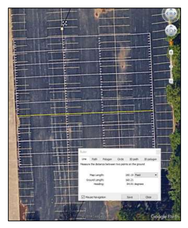
Figure 4. Example of estimating linear feature length within the Google Earth Pro interface.