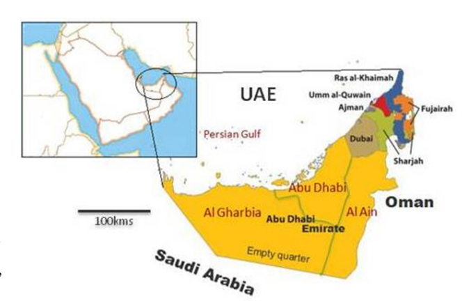
Figure 1. Al-Gharbia region, Abu Dhabi, UAE

included 585 budgeted nursing positions; 435 positions were filled, with the remainder in the process of being filled. Only one of these positions was filled by an Emirati nursing graduate.<sup>[4]</sup> The AGHS provides primary, secondary, and selective tertiary care to patients in the region. People requiring interventions for high-risk conditions are usually transferred to other hospitals in the city of Abu Dhabi.