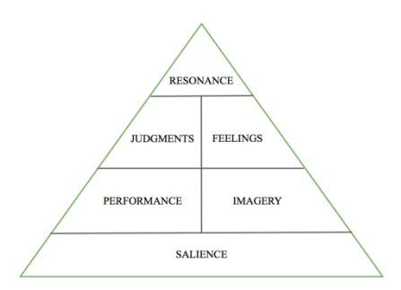
Figure 1. Brand Resonance pyramid customer-based brand equity model pyramid

Source: Keller, K. L. (2009). Building strong brands in a modern marketing communications environment. Journal of Marketing Communications , 15(2/3), 139-155.doi:10.1080/135272609 02757530