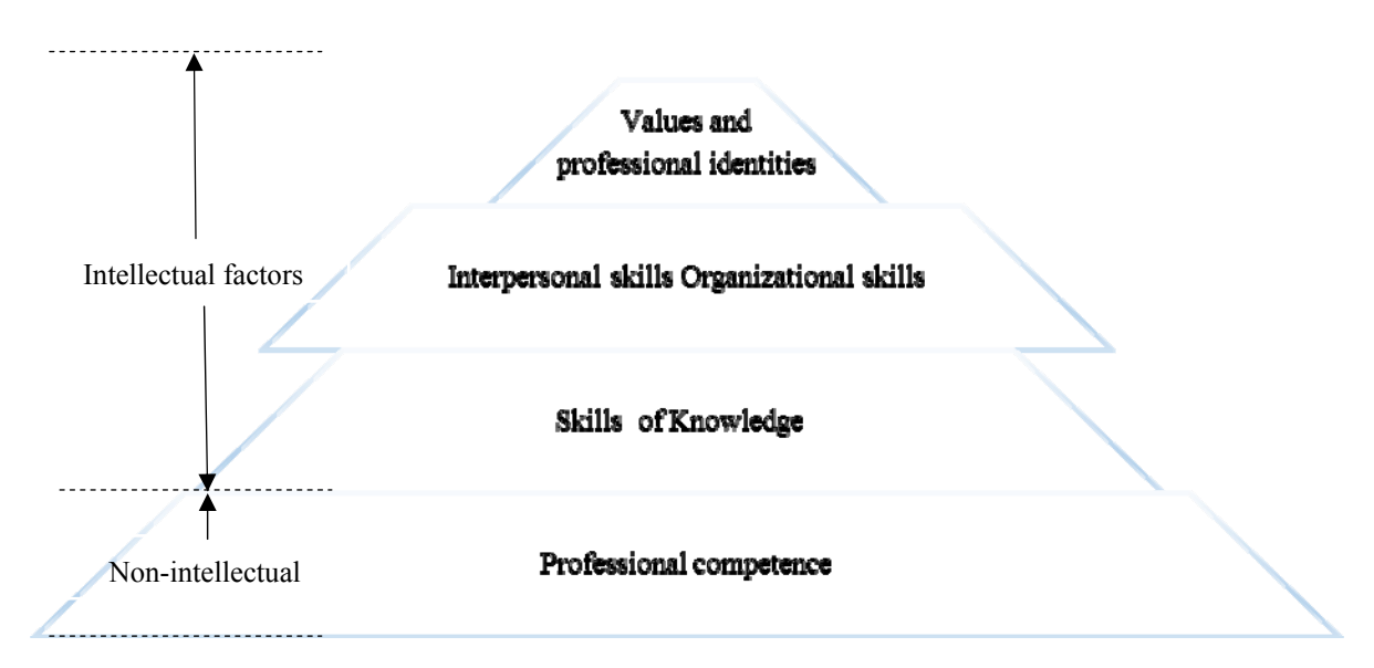
Figure 1. Basic framework for the financial professional competence

At the top of the framework, values of professional identity belong to the ideological category. Financial education should cultivate students' moral concept and strengthen the social responsibilities. At the same time, we should pay great attention to cultivate the students' financial emotion and the professional identity. Only devote themselves from heart to a financial professional, can they continue to learn, research and innovate to promote their financial theory and practice.