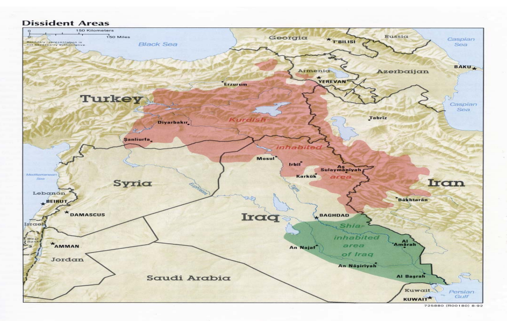
Map 1. Estimated Zones of Main Kurdish lodging. (Fondation-Institut kurde de Paris)