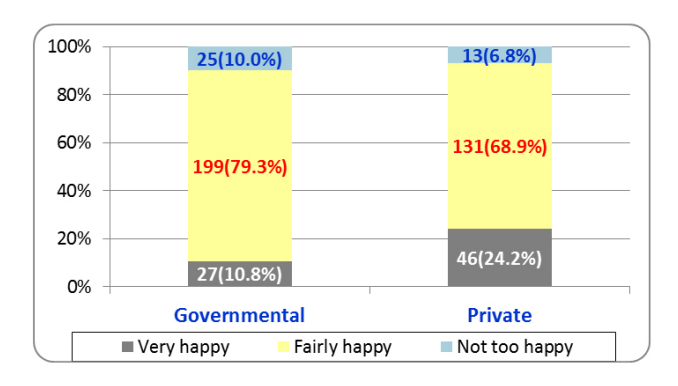
Figure 1. Rating of nurses' happiness according to the type of hospital as presented by percentages

Figure 2 demonstrates rating nurses' awareness of their influence on work among both study groups. The majority of both groups (86.6% and 62.5%) reported the moderate perception level of their influence on work. But, regarding the high perception level of influence on work among both groups; it was in favor of the nurses who are working in the private hospital (27.5% vs. 8%) and p < .05.