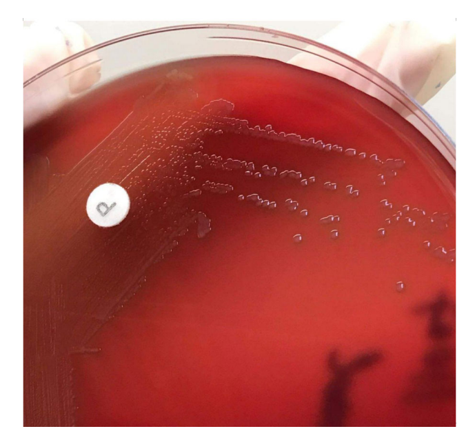
Figure 2. Small, alpha hemolytic colonies on SBA showing resistance to optochin

breakpoints.<sup>[11]</sup> All testing of antibiotics showed comparable results when repeated by the reference laboratory.