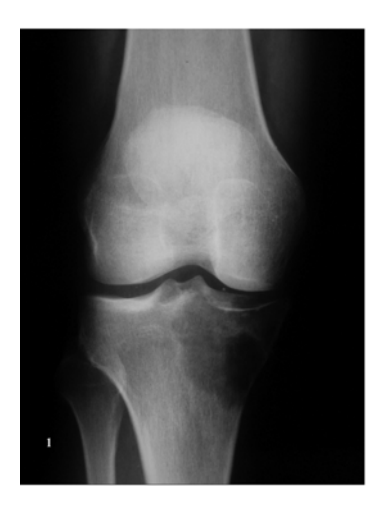
Figure 1. Radiograph of the left knee showing an epiphyseal/metaphyseal lytic lesion involving the left medial tibial condyle

The patient was a 30 year old female who presented with pain in the region of the left knee. The patient was previously healthy and had no history of neurofibromatosis. Physical examination was unremarkable. Radiologic evaluation of the left knee showed an epiphyseal-based lytic lesion involving the left medial tibial condyle which was felt to represent a giant cell tumor of bone (see Figure 1). There was no soft tissue involvement. An incisional biopsy was performed and a diagnosis of metastatic adenocarcinoma from an occult primary was rendered. Clinical work-up, including computerized tomography of the chest, abdomen, and pelvis, was negative. Despite radiation therapy, the tibial lesion progressed, and eight months later an en-bloc resection was performed with a resulting diagnosis of low grade spindle cell malignancy. The glandular component, which had been conspicuous in the first biopsy, was essentially absent at this point.