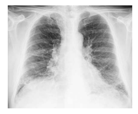
Figure 1. Chest X-ray film obtained upon admission in December 2008 shows volume loss and reticular shadows in both lower lungs.

A 71-years-old male with diabetes mellitus was referred to our hospital for further examination of chest abnormal shadow (see Figure 1) and persistent dry cough. He was a current smoker (30 cigarettes/day for 50 years), but had no obvious history of exposure to any dust.