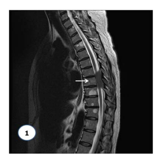
Figure 1. T2-weighted MRI shows a low signal intensity spinal mass extending from T7 to T9 (arrow)

A 52-year old woman presented with signs and symptoms of thoracic spinal cord compression. Physical examination revealed no skin lesions or organomegaly. Complete blood count was entirely normal, with hemoglobin 13.6 g/dl, WBC 7,000/µl with a normal differential (no blasts), platelet count 346,000/µl. Serum chemistry profile showed creatinine 0.8 mg/dl and albumin 4.7 g/dl. There was no evidence of a coagulopathy. Past medical history included papillary carcinoma of the thyroid six years earlier, treated with thyroidectomy and radioactive iodine. Magnetic resonance imaging (MRI) performed during the present admission demonstrated a mass lesion occupying the left side of the spinal canal and extending from the level of the seventh to the ninth thoracic vertebral bodies (see Figure 1). Emergency treatment consisted of high-dose dexamethasone and decompression laminectomy with partial resection of the epidural mass. Hematoxylin and eosin (H&E)-stained sections of lesional tissue demonstrated sheets of immature-appearing mononuclear cells with eccentric nuclei and finely granular pink cytoplasm (see Figure 2). Fine needle aspirate (FNA) of the lesion consisted of mostly peripheral blood. A single cell with prominent Auer rods was identified, consistent with a malignant non-microgranular promyelocyte.