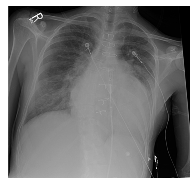
Figure 1. Admission Chest X-Ray: Notable for significant cardiomegaly and interstitial opacities consistent with pulmonary edema. Sternal wires, scoliosis and possible small left pleural effusion are also noted

Due to her enlarged aortic root, prominent mitral leaflet prolapse, scoliosis and arachnodactyly, de novo MFS was suspected. She was evaluated with the modified Ghent nosology and met the diagnostic criteria. Her systemic score was determined to be 9 (positive score > 7, see Tables 2 & 3). Her enlarged aortic root had a calculated z-score of 3.9 (positive z-score > 2) using the Marfan.org diagnostic software. Subsequent FBN1 gene sequencing discovered a frameshift mutation resulting in premature peptide truncation due to an early stop codon that was consistent with MFS.