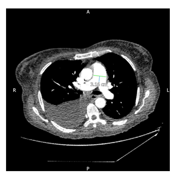
Figure 1. CTPA showing enlarged main pulmonary artery and right pleural effusion

any features of amyloidosis and excluded an intra-cardiac shunt (see Figure 2). Over the course of next 2 months she developed hypothyroidism (thyroid stimulating hormone [TSH] -9.82 mU/L), impaired renal function (eGFR 54 ml/min/ 1.73 m<sup>2</sup>) and a large multi-loculated right pleural effusion that required admission for thoracocentesis on two occasions. Her condition deteriorated despite medical therapy and she was referred for further investigations at the nearest pulmonary hypertension center.