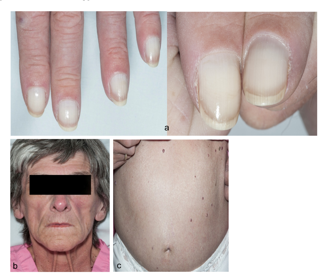
Figure 4. a: Appearance of the fingers, showing white nails with finger clubbing; b: Facial lipoatrophy; c: Abdominal wall haemangiomata

histopathological examination of a resected axillary lymph preted as confirming the diagnosis of POEMS. node was unremarkable. Serum VEGF levels were raised at 4,758 pg/ml (normal value < 771 pg/ml), which was inter-