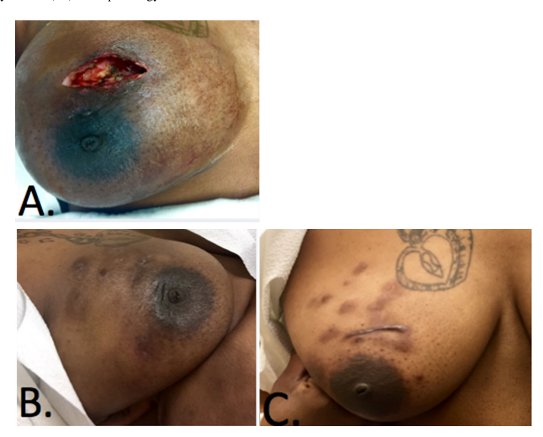
Figure 3. A. Right breast after surgical biopsy; B. Right breast after the start of Prednisone with continued, active granulomatous lesions; C. Right breast after the start of Dapsone with mild, active granulomatous lesions

explain Dapsone's efficacy in both DH and SS.