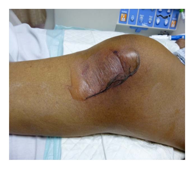
Figure 1. Tense bullae on a pressure site

Serial tissue sections of skin demonstrate the development of an intraepidermal acrosyringeal bulla, accompanied by superficial, non-inflammatory purpura and stromal edema (see Figure 2). One sees modest stromal RBC extravasation, mild capillary ectasia, mild stromal edema and hemosiderin deposition in the subcutaneous fat. The adjacent epidermis appears intact, without spongiosis, inflammation or ischemic changes.