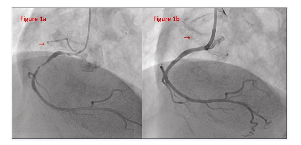
Figure 1a. It showed coronary angiography of the RCA before PCI. An arrow was a conus branch. Figure 1b. It showed coronary angiography of the RCA after PCI. An arrow showed the occluded conus branch.

ECG change and chest pain. Cardiac enzymes were not elevated after the procedure. She was followed up for 12 months without chest pain. Follow-up coronary angiography showed recanalization of the conus branch artery fortunately.