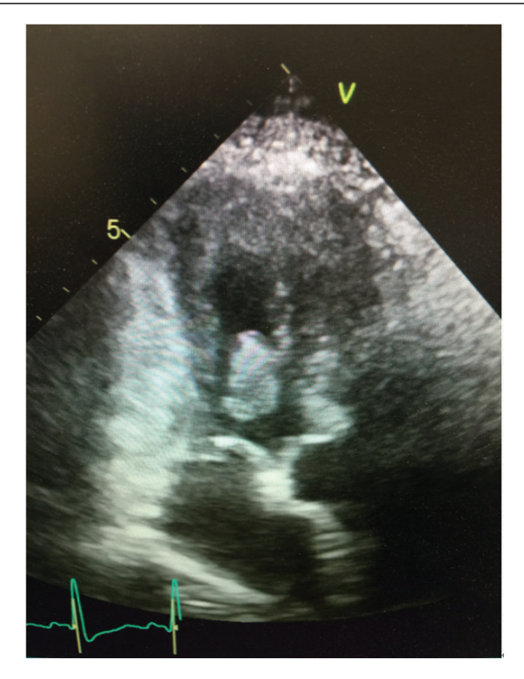
Figure 6. Cardiac sarcoma seen on an apical 2-chamber view on transthoracic echocardiogram

The patient remained hemodynamically stable throughout the hospital course and did not require oxygen. Her acute treatment options included anticoagulation for her pulmonary embolus and surgery. The patient did not have any symptoms consistent with the tumor causing compression of cardiac structures. Given her severe metastatic disease, surgical options were declined in favor of anticoagulation. She was to continue her chemotherapy regimen of ifosfamide and doxorubicin with monthly doses of neulasta were administered by her oncology team with her oncology team. Given the extent of her metastases, palliative care was consulted for pain management and goals of care. The patient was treated with anticoagulation using enoxaparin and her symptoms continued to improve. The patient eventually was stable enough to go home and she was scheduled to follow-up with her oncologist.