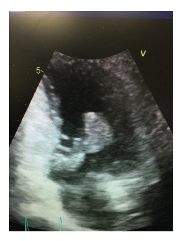
Figure 5. Another magnified view of a sarcoma attached to the left ventricle seen in an apical 4-chamber view on transthoracic echocardiogram