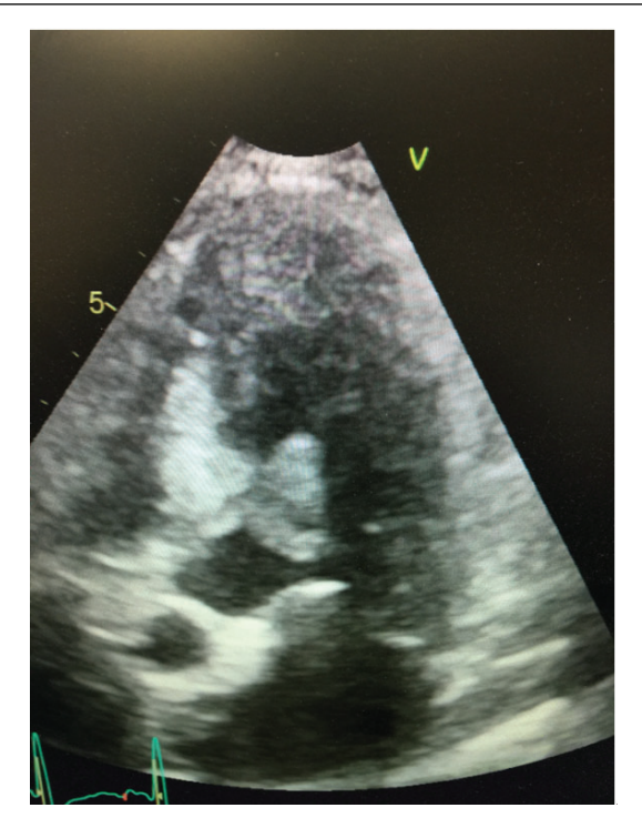
Figure 4. Cardiac sarcoma attached to the left ventricle seen in an apical 4-chamber view on transthoracic echocardiogram

A two-dimensional echocardiogram was then performed at this admission to evaluate her dyspnea. The echocardiogram revealed a new 2.3 cm \times 1 cm echogenic mass attached to the left ventricular basal septum (see Figures 4-6). Left ventricular wall motion was hyperdynamic with a left ventricular ejection fraction of 70%-75%. Grade 1 diastolic dysfunction was demonstrated as well. There was a maximum left ventricular outflow tract gradient of 10 mmHg. Pulmonary hypertension was not appreciated and there were no shunts detected on color Doppler. There were no other cardiac abnormalities detected on the echocardiogram.