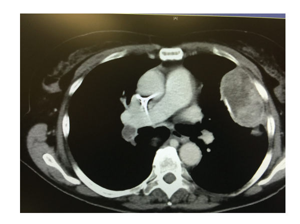
Figure 2. Chest CT revealing large left lung pleural mass

ent bilaterally. The middle right lower lobe demonstrated a pulmonary embolism.