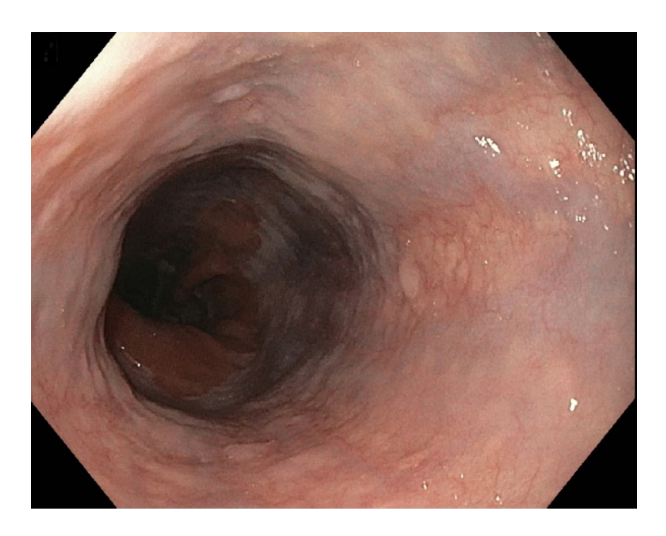
Figure 1. Small esophageal varices in the distal esophagus

time of presentation was a proton pump inhibitor for reflux. Calcium and triglyceride levels were normal and the biliary tree was normal on abdominal imaging.