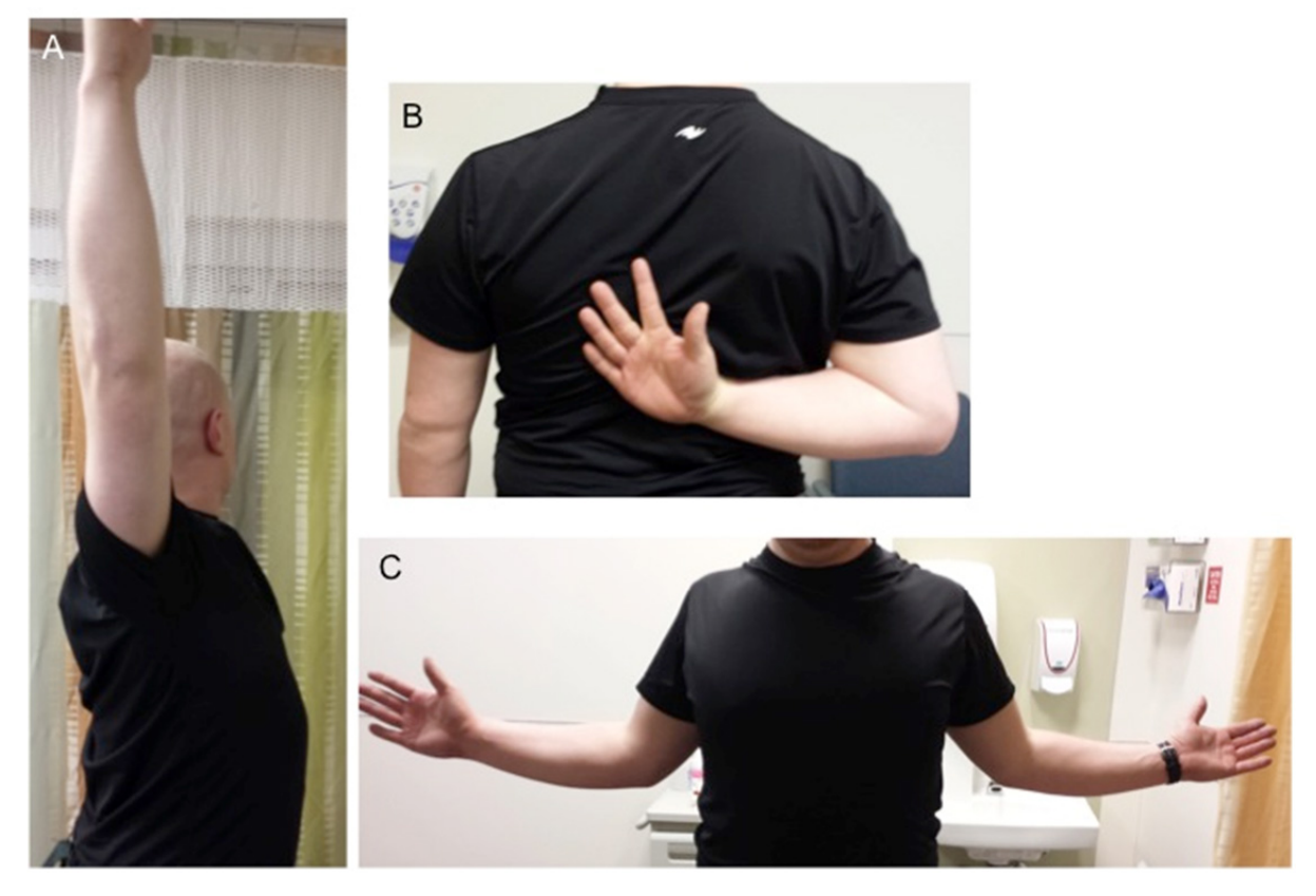
Figure 4. Post-operative range of motion The patient had full and symmetric forward elevation (A), internal rotation (B) and external rotation (C) in the operative arm.

A. Arthroscopic image with the camera in the posterior viewing portal and in the axillary pouch. The pouch is indented by the osteochondroma as the arm is brought into an abducted and externally rotated position; B. Image of the exposed osteochondroma (black arrow).