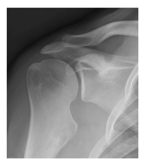
Figure 1. Anteroposterior (AP) Radiograph of the right proximal humerus

osteochondroma into view as it impinged on the axillary pouch (see Figure 3A). No humeral avulsion of the glenohumeral ligaments was noted. A deltopectoral approach was then employed to access the proximal humerus. The subscapularis was tenotomized and peeled off the capsule as a separate layer. The capsule was then sharply dissected off the humeral neck around to the 8 o'clock position. Sharp and blunt dissection was used to expose the osteochondroma (see Figure 3B) and retractors protected the other vital structures. The osteochondroma was excised. Repair of the capsule was performed using titanium anchors, introducing a small capsular shift, while the subscapularis tenotomy was repaired with non-absorbable suture. Rehabilitation proceeded as routine for an open shoulder procedure: range of motion exercises for 12 weeks, followed by strengthening and proprioception after 12 weeks. Pathology was consistent with a completely benign lesion.