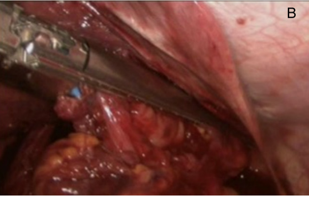
Figure 2. Laparoscopic approach for esophagectomy with gastric ascent A shows the dissection of the esophagus on the laparoscopic approach; B shows the endoscopic stapler on the site of the gastric ascent.