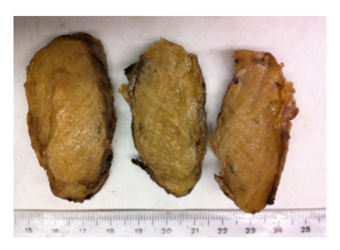
Figure 2. Macroscopic image of the resection piece

The tumor cells were stained with S100 protein (see Figure 3C). CD31, CD34 and Vimentin markers also stained the cells (see Figure 3D, 3E and 3F). Regarding the cytogenetic issues, Fluorescence in situ hybridization (FISH) detected deletions on chromosome 11q13 (see Figure 4). We did not have evidence of malignancy and the final diagnosis was lipoma-like hibernoma. The patient did not report signs of recurrence after ten months from its extirpation.