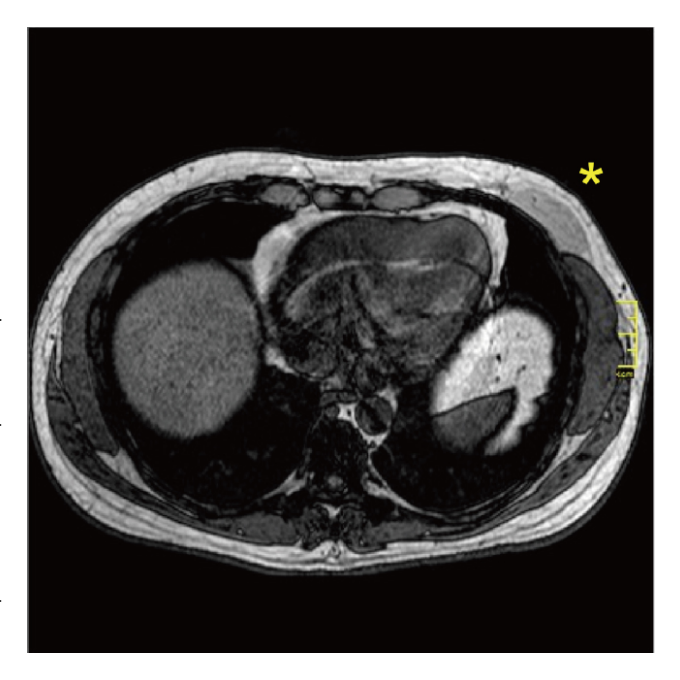
Figure 1. Magnetic resonance imaging of the thorax demonstrates a mass in the anterior part of the axilla (axial view)

teristics. The mass measured 5 cm \times 3 cm. Microscopically, the report described a proliferation of unilocular adipocytes with eccentric nucleus and, in less frequency, multilocular adipocytes with central nucleus (see Figure 3A and B).