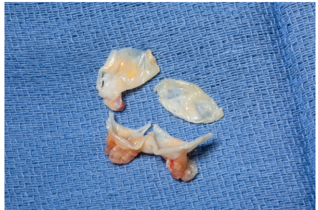
Figure 2. Quadricusp aortic valve surgical specimen

Antibiotics were narrowed based on susceptibilites. He underwent aortic valve replacement with a tissue valve five days after admission. Intraoperatively, he was noted to have a quadricuspid aortic valve (type B according to the Hurwitz classification) with a small extra leaflet between the noncoronary cusp and the left coronary cusp (see Figure 2). He had vegetations with perforations on the extra leaflet and noncoronary cusp. Surgical pathology showed active native valve endocarditis with cocci identified and with focal purulent inflammation and valve destruction. Intraoperative broad range PCR was positive for Gemella sanguinis . His postoperative course was largely unremarkable, and he was discharged to complete a 6 week course of IV antibiotics.