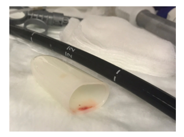
Figure 3. Plastic Tide-To-Go cap removed