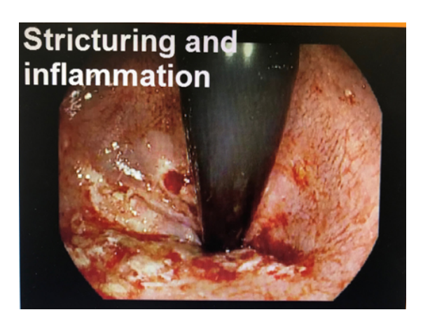
Figure 1. Friable rectal mucosa with stricturing and inflammation

After discussing the stricturing noted in the rectum with the patient, he revealed that he had previously inserted approximately 20 different objects requiring repeat interventions for removal. We counseled him extensively on the risk of perforation and he stated that he understood and that he was ready to put colorectal foreign bodies behind him.