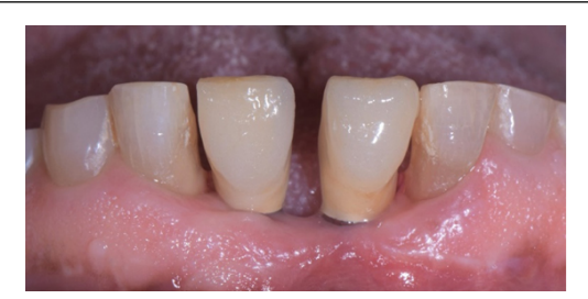
Figure 5. Clinical photograph after fixtures placement