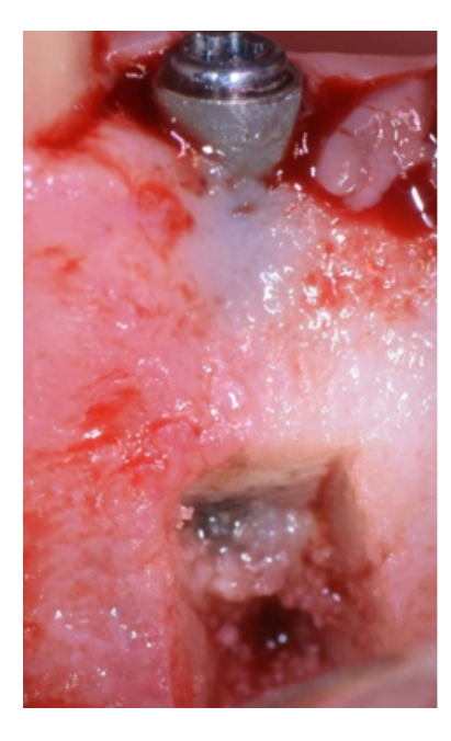
Figure 3. Photograph of implant site at four months after implant placement. Bone loss around the implant neck and the site of the biopsy is visible

Periapical radiographs allowed us to follow the evolution of the lesions following the implant placement. At the 2-month follow-up, a radiograph showed maturation of both lesions. The changes in the nature of the bone tissue did not seem to affect the favorable osseointegration of the implants. After seven months, implants were loaded with single crowns (see Figure 5). At a 6-month follow-up, a periapical radiograph showed that the lesions were stable and the implants osseointegrated and functional (see Figure 6).