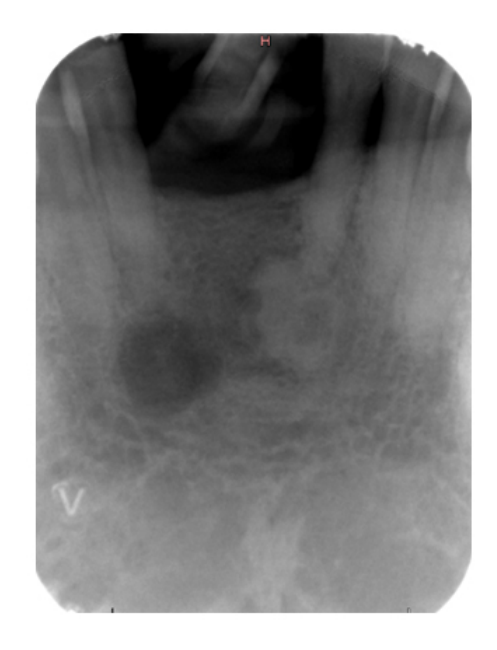
Figure 1. Initial periapical radiograph. Lesion at an osteolytic stage in the periapical region of tooth # 42 and cementoblastic stage at the apex of tooth # 32

The patient requested implants therapy to replace the missing teeth in the anterior mandibular area. She was informed about the risks due to her condition. Two dental implants Straumann<sup>(R)</sup> BLT with a 2.9 mm in diameter and a 10 mm length, were placed at the edentulous sites. The two-stage dental implant surgery was chosen in order to avoid any infection by burying implants during the healing period. The apical portion of the implants was placed within the osseous lesion due to its proximity to the alveolar ridge. Follow-up showed good healing at the implant sites. A few months later, the bone loss occurred around the implants' necks and caused their exposition (see Figure 3). A connective tissue graft was carried out to cover the defect, as well as a biopsy of the lesion at the apex of implant # 31 was performed to confirm the clinical-radiological diagnosis.