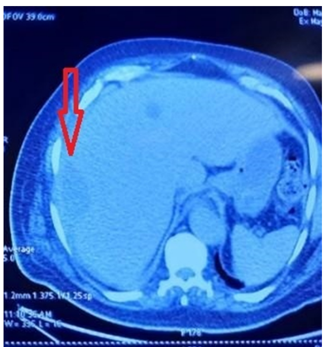
Figure 3. Space occupying lesion in right lobe of live (arrow)

Further evaluation was done by conducting a whole body PET CT scan which showed—non-FDG avid, lobulated, pleural-based soft tissue mass in the left lung lower lobe and large centrally hypodense/necrotic lesion with peripheral FDG uptake in the right lobe of the liver (see Figure 4). This report left the treating doctors in dilemma and inquisitiveness regarding the nature of the lung tumor.