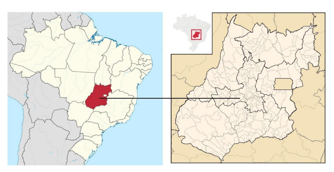
Figure 1. Location of the State of Goi ás on the map of Brazil

The State of Goi ás has an area of 340,106 km2 and a population of 7,206,589 inhabitants (IBGE; UNDP, 2021) distributed among 246 municipalities (Figure 1).