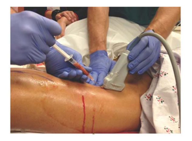
Figure 4. In-plane ultrasound-guided aspiration of pus from proximal thigh