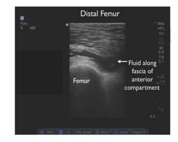
Figure 2. Transverse view of distal left thigh shows complex fluid collection seen within muscles of anterior compartment