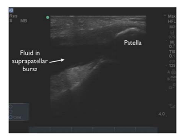
Figure 3. Sagittal view of fluid collection seen in supra-patellar bursa