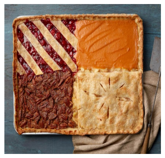
Figure 2. 4-Piece Pie Illustrating Word Problem in (12)

(13) Illustration of word problem in (12)