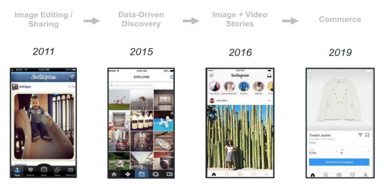
Figure 1. Instagram image sharing enhancement evolution

In 2011, the first profiles appeared on this social network; in 2015, advertising on Instagram became available all over the world; in 2016, it became possible to create a business profile; in June 2018, Instagram announced the number of users of this social network exceeded 1 billion; in 2019 there was a huge number of brands offering their products. The average age of Instagram users is 18-34 years [15]. Instagram is misconstrued as a "network for blondes." Statistical data refutes this thesis. Instagram has everything, with approximately the same ratio of men and women.