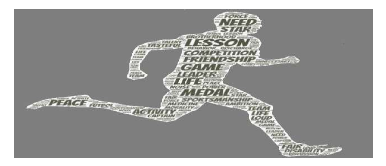
Figure 1. Metaphors of school principals related to physical education

As it is seen in Figure 1, a large number of metaphors were produced by the school Principals regarding the concept of physical education, and the metaphors produced were given in the form of a word cloud according to the metaphor's usage frequency. It was determined that metaphors which are mostly used by principals are; lessons, activity, life, competition, talent and need.