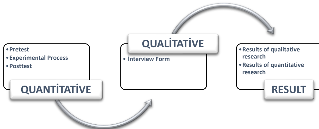
Figure 1. Research Process

procedures were analyzed, and in the second stage, the results obtained in the experimental procedures by collecting qualitative data were explained in detail.