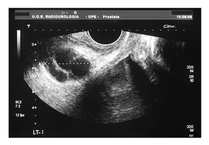
Figure 4. Lymphocele. Ultrasonography showing the presence of a lymphocele misdiagnosed at the cystography.

Figure 3. Sovrapubic Ultrasonography. The urinary leakage is also detected in the same patient with sovrapubic ultrasonography.