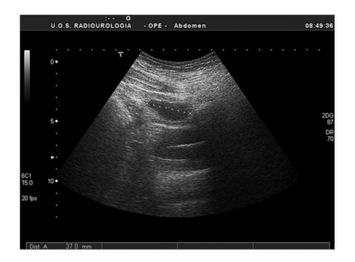
Figure 3. Sovrapubic Ultrasonography. The urinary leakage is also detected in the same patient with sovrapubic ultrasonography.