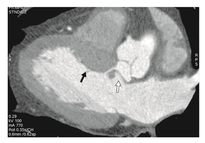
Figure 2. A three chamber view demonstrating marked thickening of the septum (black arrows) in a patient with hypertrophic cardiomyopathy and systolic anterior motion of the anterior leaflet of the mitral valve (white arrows)

and possibly perfusion defect.<sup>[28]</sup> In addition, CCT may be useful for screening family members of HCM patients for preclinical HCM, namely by detection of LV crypts, which are defined as blind pits extending into but confined by the myocardium.<sup>[29, 30]</sup> LV crypts have been identified with a high rate of occurrence of 81% in HCM mutation carriers who had not yet developed LV hypertrophy, and are suggested to be one of the early pathologic alterations of the myocardium that ultimately progress into HCM. However, more studies are needed regarding the natural history and prognosis of this particular finding.