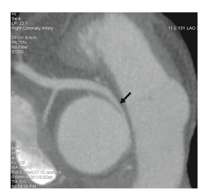
Figure 5. Anomalous coronary artery. This demonstrates a curved multiplanar image of the right coronary artery arising from the left coronary cusp and running between the pulmonary artery and the aorta (arrow depicts anomalous coronary artery).

Given its ability to noninvasively image coronary arteries, CCT is the imaging modality of choice to identify anomalous coronary artery origins or unusual angulations of the coronary artery ostia, with high accuracy and greater ease than by invasive cardiac angiography<sup>[42]</sup> (see Figure 5). Shi et al. reported that anomalous coronary arteries detected on conventional angiography were only 35% of those detected on 16-slice CCT.<sup>[43]</sup> Karaca et al. performed CCT in a group of 52 patients shown to have anomalous coronary arteries by conventional angiography and demonstrated that it easily depicted the anomalous vessels and their courses, even in those that conventional angiography failed to delineate.<sup>[44]</sup> In particular, it is able to precisely localize anomalous vessels in relation with the aorta and pulmonary artery and detect potentially malignant courses, whereas conventional angiography does not reliably define this course.