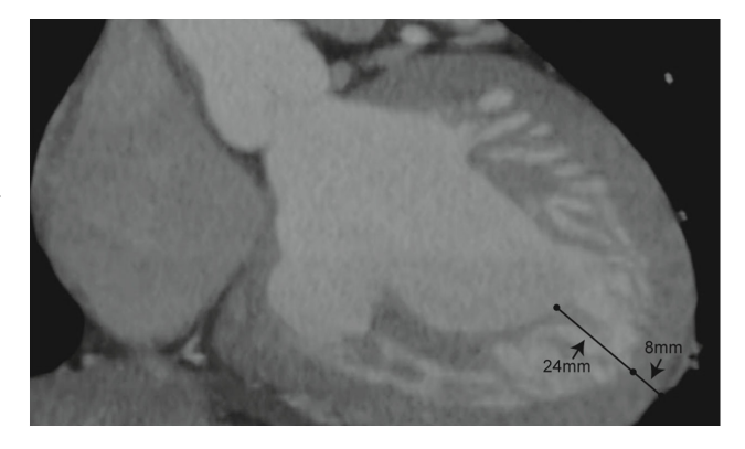
Figure 4. A coronal view of a ventricle demonstrating multiple striations consistent with noncompaction. The noncompacted tissue was 24 mm in diameter, the compacted (normal) myocardium was 8 mm.

is thought to be proximal severe spasm, usually in the context of severe exertion, leading to ischemia and subsequent arrhythmia.<sup>[40]</sup> Patients in whom the proximal segment of an anomalous coronary artery courses between the aorta and pulmonary artery are at a particularly increased risk of fatal arrhythmias and sudden death,<sup>[41]</sup> while other possible indicators of risk from SCD also include acute angle of takeoff of the anomalous vessel from the aortic sinus, a slit-like orifice, an interarterial course and an intra-mural aortic segment.<sup>[7]</sup>