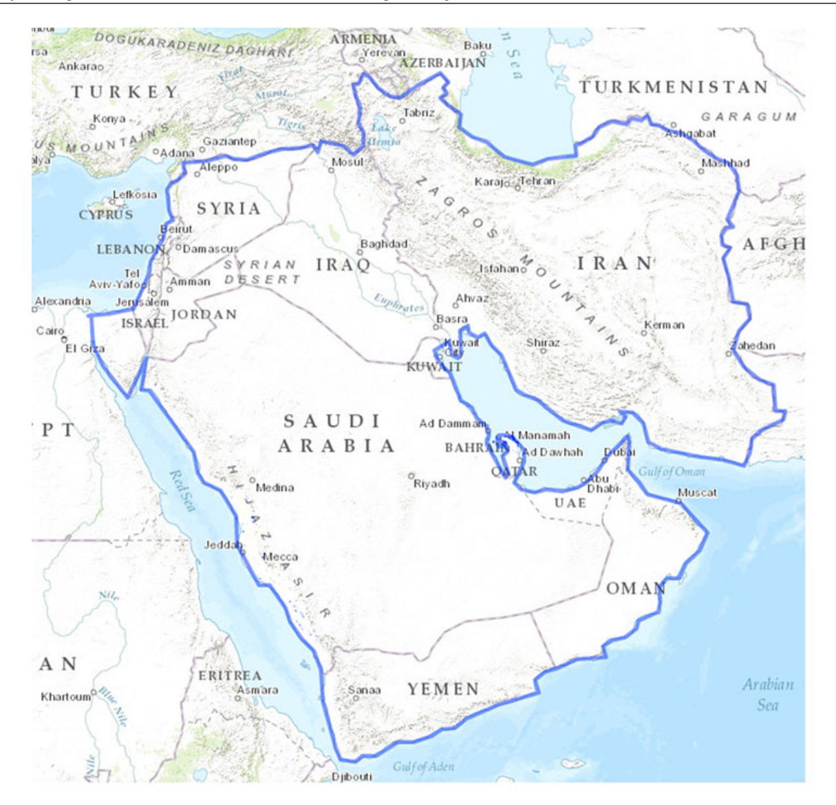
Figure 1. Geographical representation of the Middle East Area region for the current review. (To develop this map the authors used USGS National Map Viewer, http://viewer.nationalmap.gov/viewer/)