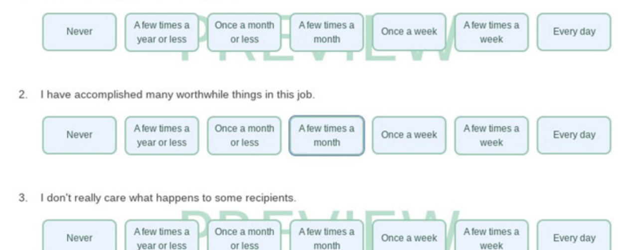
Figure 4. Sample questions of MBI

1. I feel emotionally drained from my work.