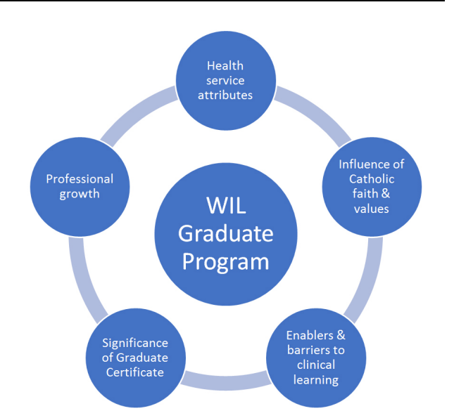
Figure 3. Qualitative Research Findings

[The health service] has been wonderful and supportive and utilizes their values and mission statement.